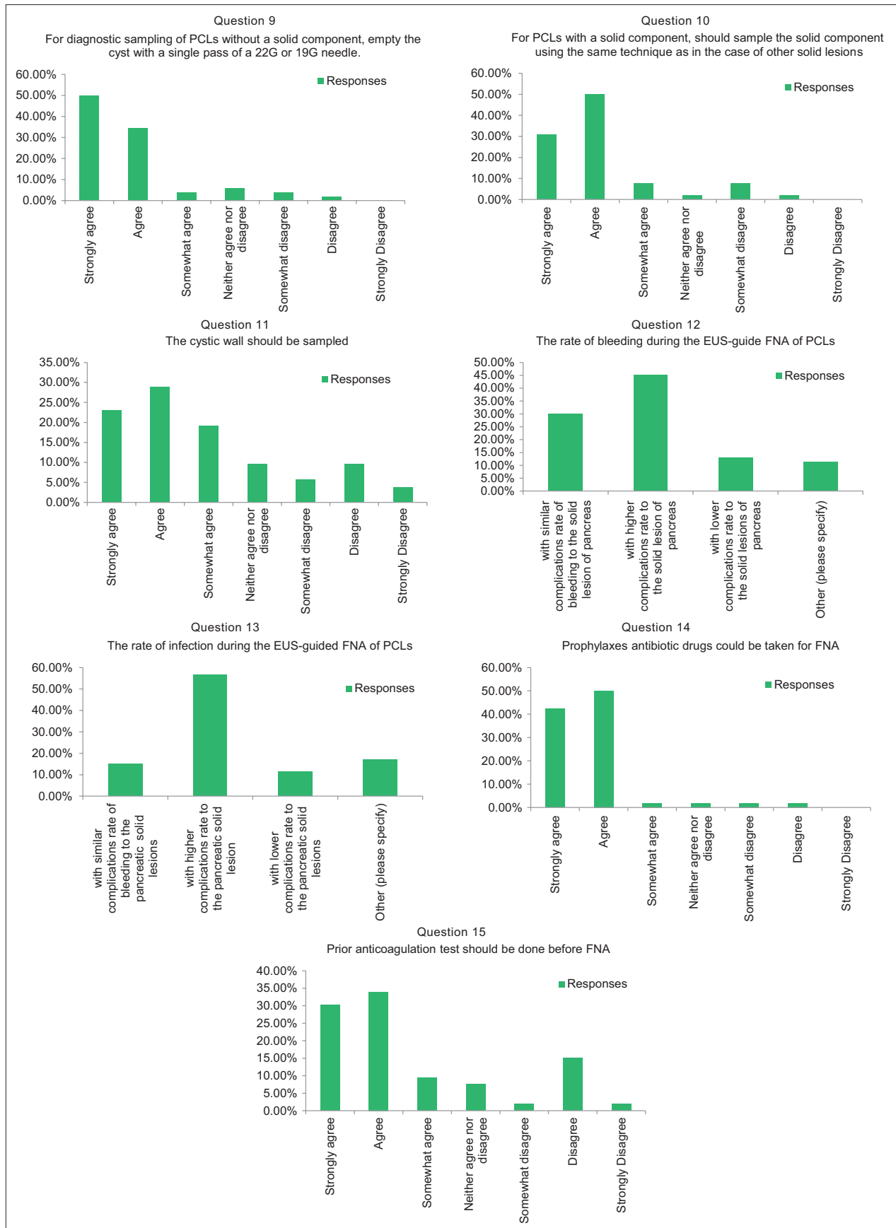
Figure 2. Contd...