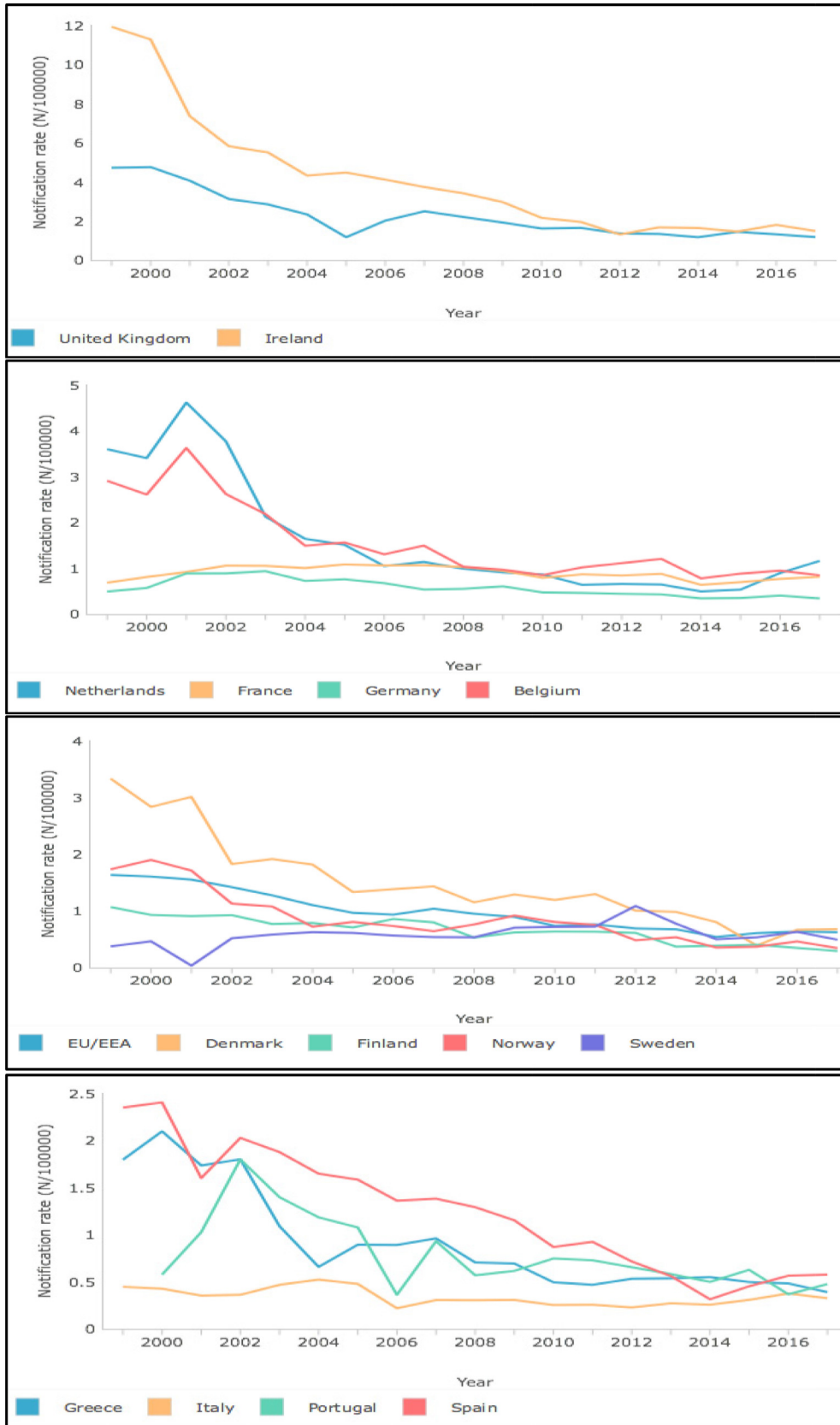
Fig. 3. Notification rates for invasive meningococcal disease (IMD) per 100,000 by country in (A) the UK and Ireland, (B) Southern Europe, (C) Central Europe and (D) Southern Europe. Reproduced from the ECDC 2017 Annual Report ( https://www.ecdc.europa.eu/sites/default/files/documents/AER_for_2017-invasive-meningococcal-disease.pdf )